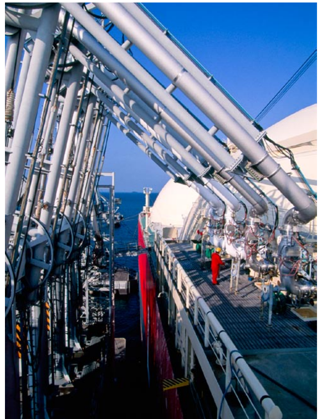
Unloading LNG From a Double-Hulled LNG Tanker Liquefied natural gas (LNG) tankers typically measure up to 1,000 feet in length and carry about 35 million gallons of LNG.

This DOE-sponsored report also notes that planned offshore facilities, such as the three currently proposed for California, are sufficiently far enough from the shore that potential casualties at the facilities would unlikely directly affect anyone on shore.