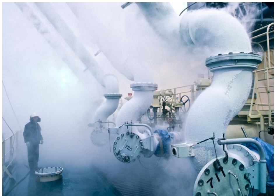
An LNG Crewman Conducts Safety Checks

FERC to decide on LNG import facilities. For offshore LNG facilities (which includes the