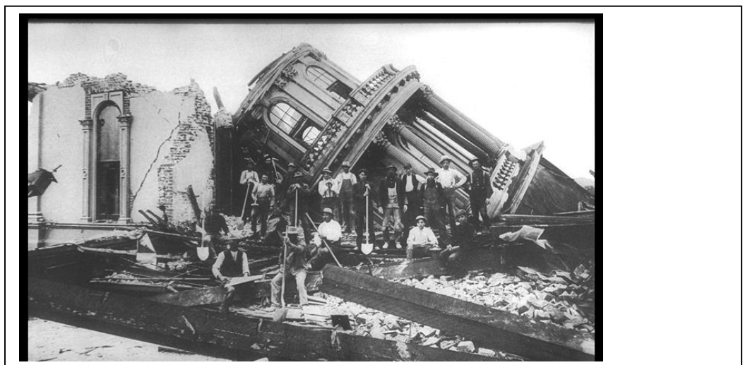
Santa Rosa City Hall in the aftermath of the great earthquake of 1906.