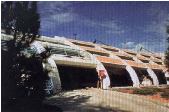
The California State University Northridge parking structure was built in the early 1990s and collapsed in the Northridge earthquake.