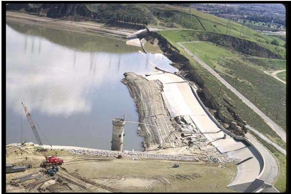
The upstream face and crest of the Lower San Fernando Dam slid into the Lower Van Norman Reservoir in 1971, prompting the evacuation of 75,000-80,000 residents downstream.

In 1982 and 1983, the commission held hearings on dam safety. Projects that were sponsored by local governments or agencies but designed and built by federal authorities were considered federal projects and did not undergo state or independent review. As with the Auburn and Warm Springs dams, the commission sought to bring independent review to all such critical projects. Finally, in 1993, the Army Corp of Engineers agreed to permit personnel from the state's Safety of Dams Division to review the safety of federal dam projects.