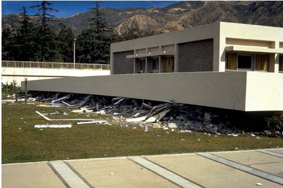
Collapse of the Psychiatric Ward of the Olive View Hospital in 1971.

In January 1972, Governor Ronald Reagan established the Governor’s Earthquake Council as the administration’s reaction to the San Fernando Valley earthquake and to the work of the Legislature’s Joint Committee on Seismic Safety. The council continued in existence until the Seismic Safety Commission was up and running in 1975.