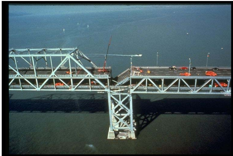
Collapse of the upper deck of the San Francisco Bay Bridge during the Loma Prieta earthquake in October 1989.